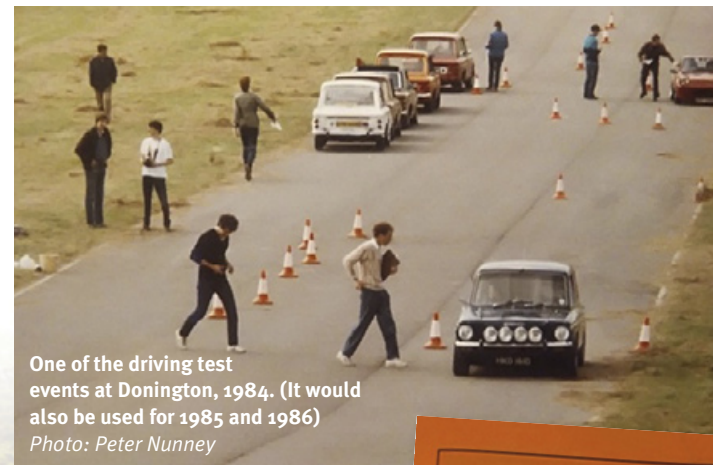
One of the driving test events at Donington, 1984. (It would also be used for 1985 and 1986)

By the end of 1984 the club had over 650 members and five active area centres with Croydon, South Coast, Bath/Bristol, Manchester and the Up North Get Together all having regular well attended meetings.