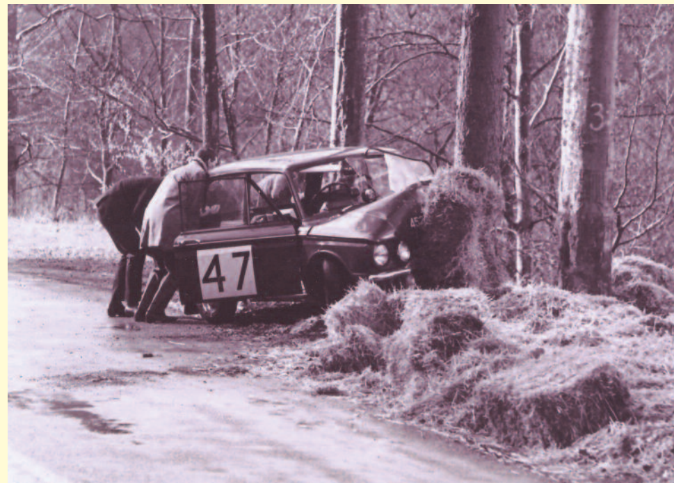
"There must be a better way to pick tulips..."