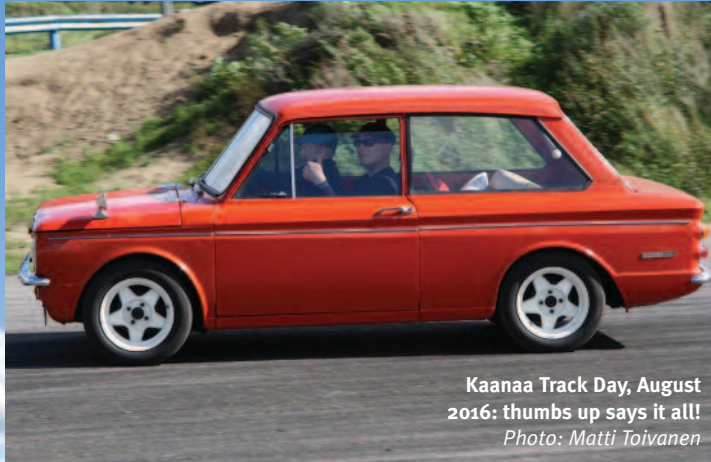
Kaanaa Track Day, August 2016: thumbs up says it all!

Almost every year, Imp Club Finland takes part in the Finnish Classic Motor Show in Lahti and 2016 was no exception. It always amazes how interested people are in our cars; in 2013 our Imp 50