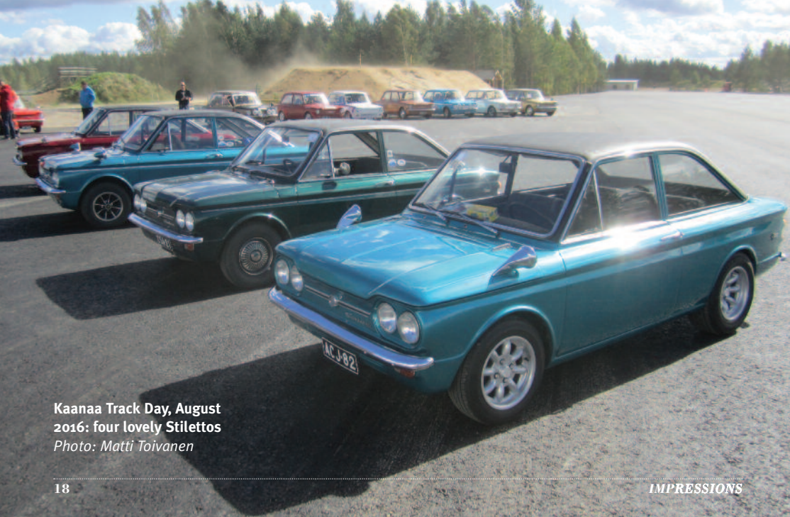
Kaanaa Track Day, August 2016: four lovely Stilettoes

anniversary display was voted the second best exhibition.