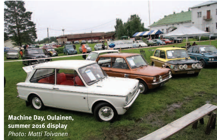
Machine Day, Oulainen, summer 2016 display