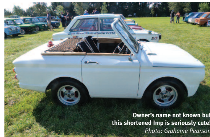
Owner's name not known but this shortened Imp is seriously cute!

were able to leave the site, bar a couple of stragglers, by about 2pm and head for home having enjoyed a great weekend.