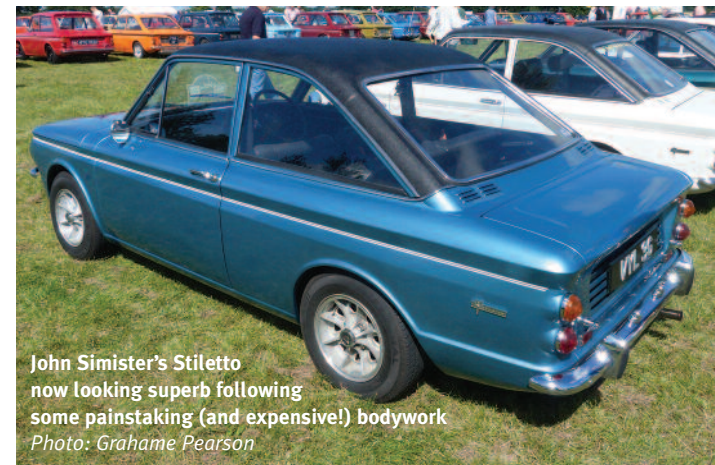
John Simister's Stiletto now looking superb following some painstaking (and expensive!) bodywork

This brought the weekend to an end and, as Monday morning dawned, it was time to say our good-byes and begin the site break down. With the help of many we