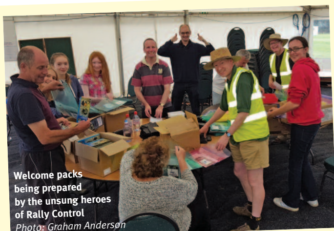
Welcome packs being prepared by the unsung heroes of Rally Control

With all going well and the campsite filling up steadily it wasn't too long before the now seemingly traditional Thursday afternoon downpour dampened the atmosphere. Fortunately it blew over quite quickly and we were treated to some fine weather throughout most of the week-