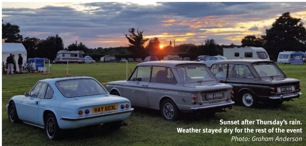
Sunset after Thursday's rain. Weather stayed dry for the rest of the event