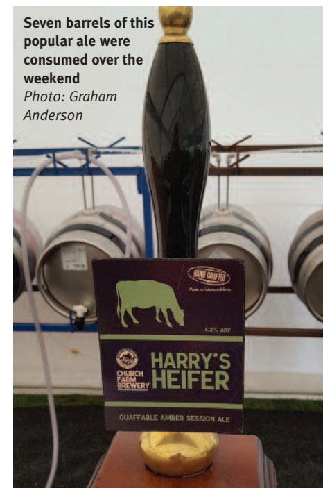
Seven barrels of this popular ale were consumed over the weekend

Fancy Dress proved very popular at the evening's fancy dress with many excellent Shakespearean costumes while others went for the alternative sartorial option and donned a hat for 'Hats on for Hatton'.