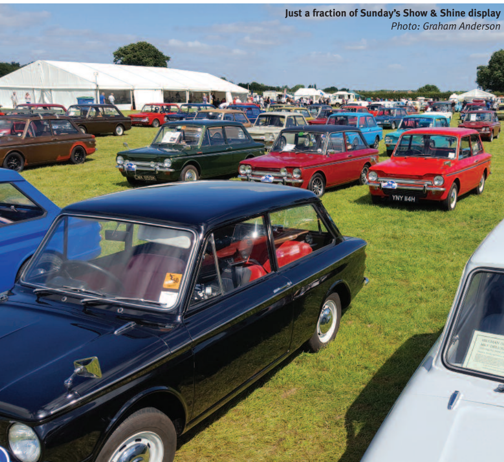
Just a fraction of Sunday's Show & Shine display