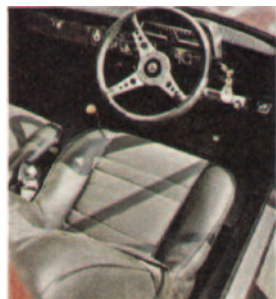
Racing steering wheel is an extra added to the nifty Singer Chamois