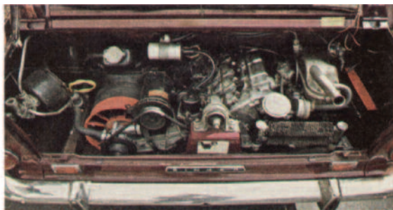
Top speed of around 90 m.p.h. delivered by the rear-mounted twin-carb engine means that Wisdom has more than enough speed for Britain's roads