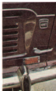
Smart rear-view of the bonnet lowered ready for