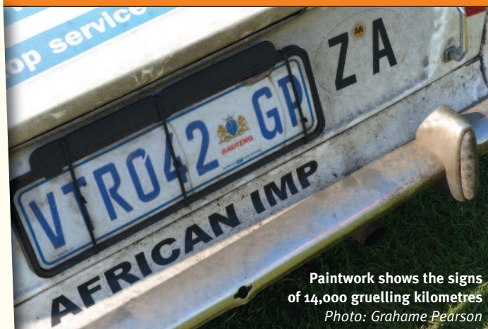
Paintwork shows the signs of 14,000 gruelling kilometres