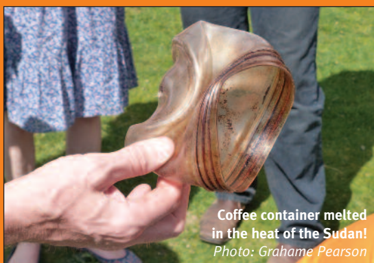
Coffee container melted in the heat of the Sudan!