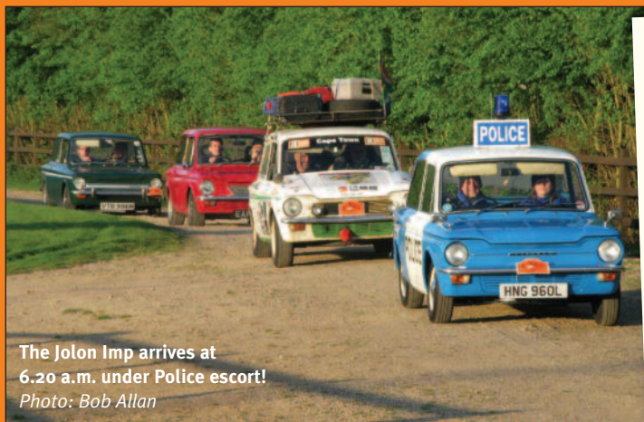
The Jolon Imp arrives at 6.20 a.m. under Police escort!