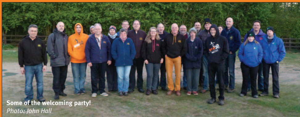
Some of the welcoming party!