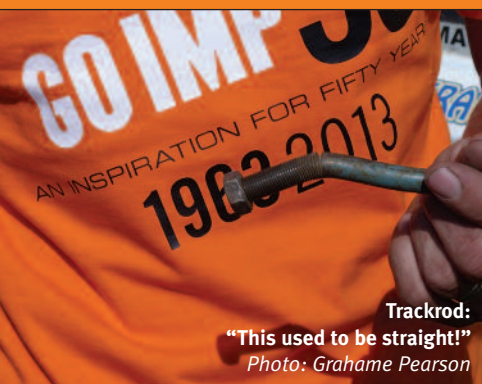
Trackrod: "This used to be straight!"