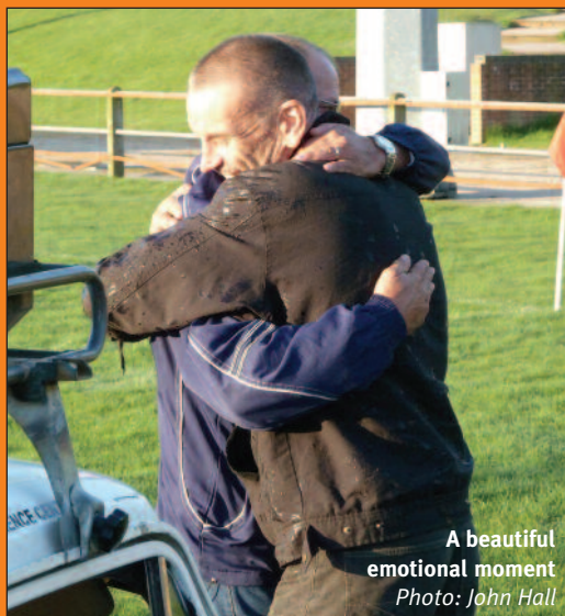
A beautiful emotional moment