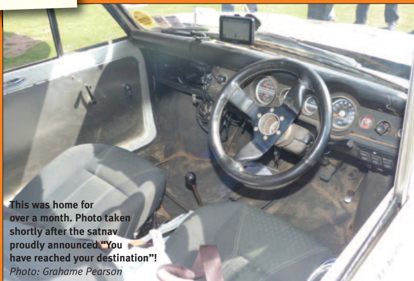
This was home for over a month. Photo taken shortly after the satnav proudly announced "You have reached your destination!"