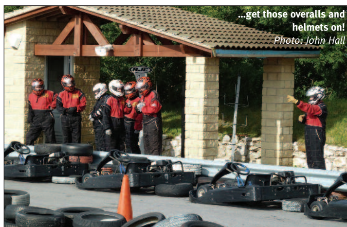
...get those overalls and helmets on!

Fortunately the weather held and Qualifying ran to schedule, after which a quick sort of the spreadsheet and we were able to provide the drivers for each Final.