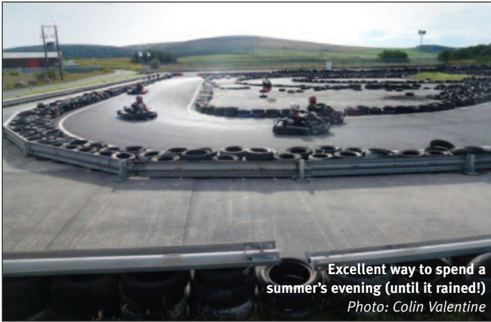
Excellent way to spend a summer's evening (until it rained!)

sent Kimberley with a message to Race Control to cut the number of laps from 15 to 10. The message came back that Race Control had already spotted the problem and made the change.