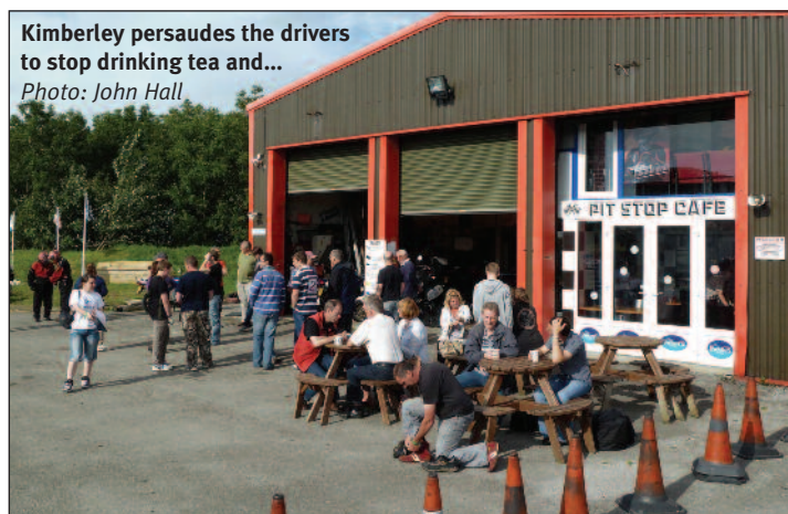
Kimberley persuades the drivers to stop drinking tea and...

Kimberley Benoy helped by bossing all these big blokes around to get them kitted up and ready, after the general briefing. The Swains were very helpful in providing Results for each Heat.